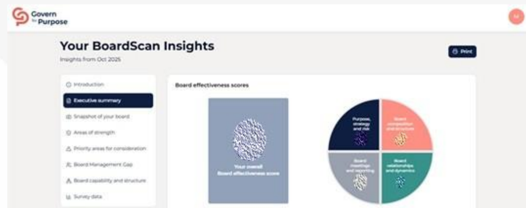
Executive summary insights page from the Govern for Purpose BoardScan portal