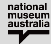
National Museum Australia